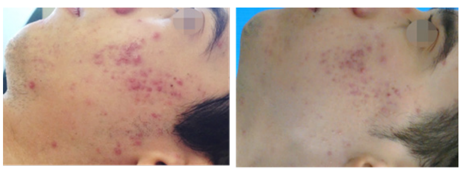
Figure 6. A 15 year old male (Fitzpatrick V) before (left) and 4 weeks after 8 treatment sessions (right) with 415nm cut-off filter, Multiple pulse structure and 7 J/cm<sup>2</sup> energy fluence.